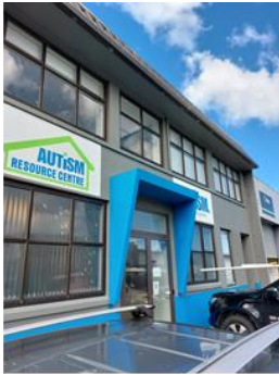
Entrance to Autism Resource Centre