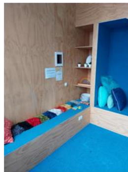
Inside transition/waiting room