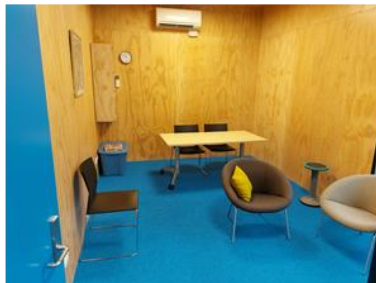
Inside main assessment appointment room