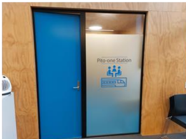
Entrance to main assessment appointment room