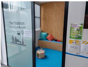
Entrance to transition/waiting room